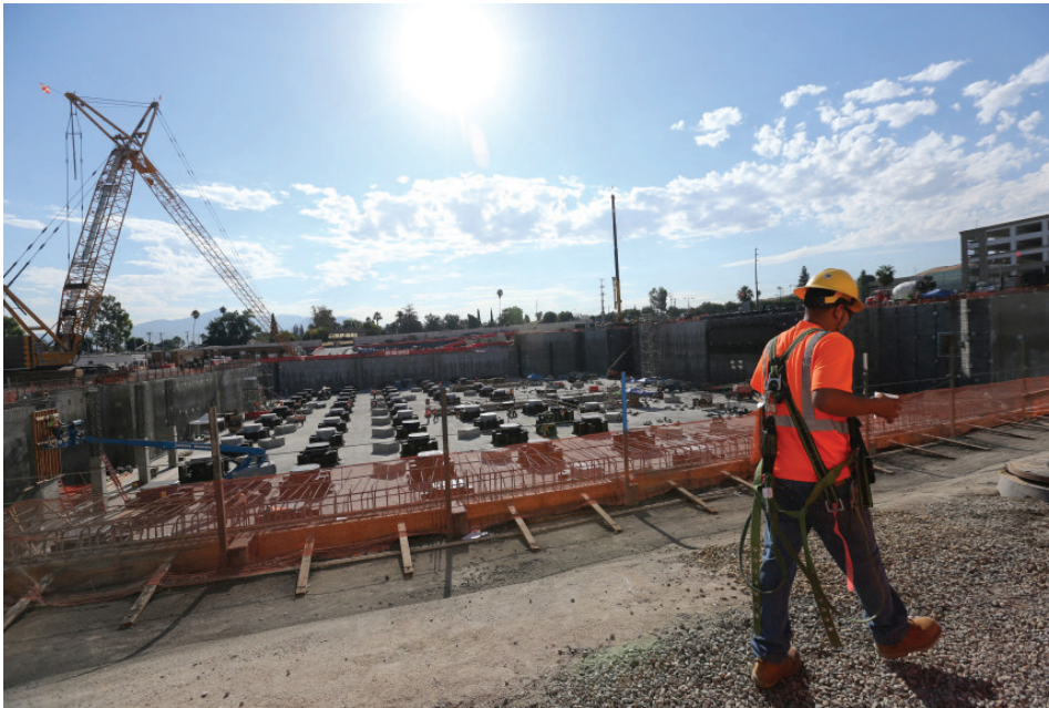
A construction worker walks around the site of the new Loma Linda University Medical Center in Loma Linda on Tuesday, Aug. 29, 2017. The hospital is being built on an earthquake protection system, being the world's first 3D seismically isolated hospital building.